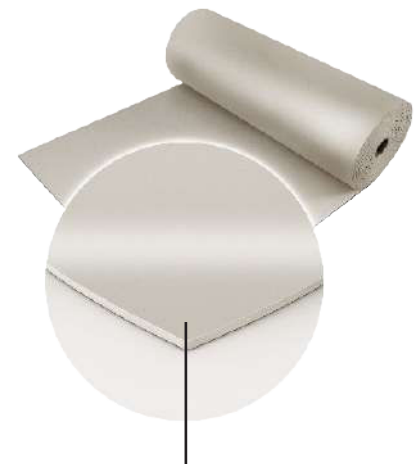
Homogeneous vinyl with support and a slip-resistant dance surface

BREEAM® vinyl plus COMMITTED TO SUSTAINABLE DEVELOPMENT