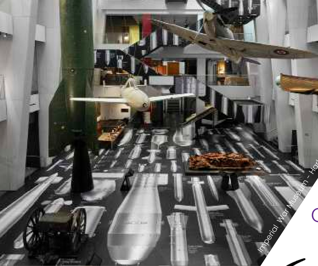
Imperial War Museum - Harlequin Clarity Printed