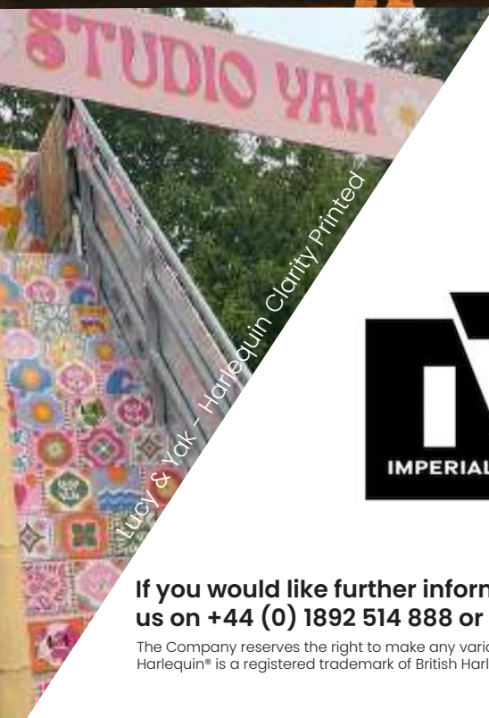
Lucy & Yak - Harlequin Clarity Printed