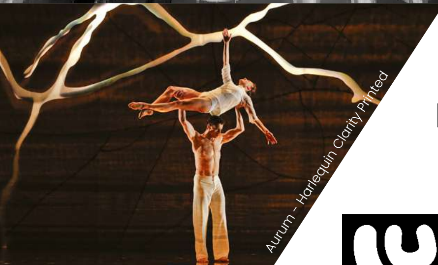
Aurum - Harlequin Clarity Printed